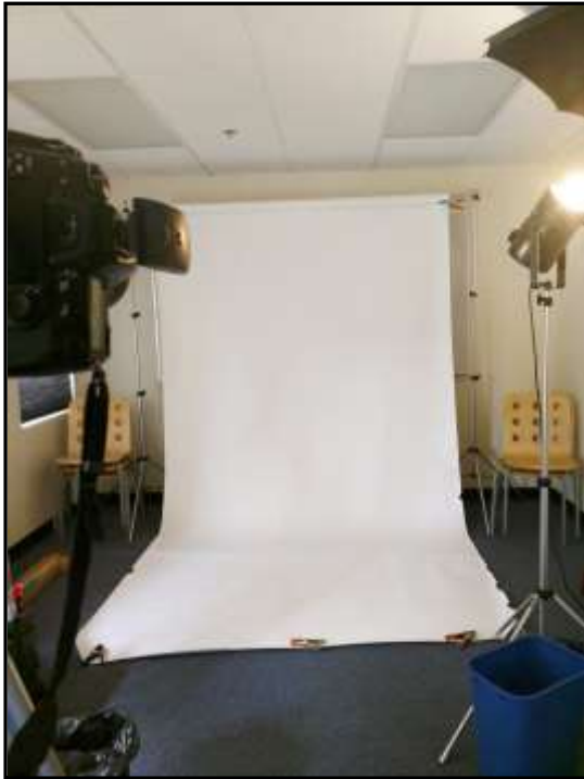
Studio Set Up